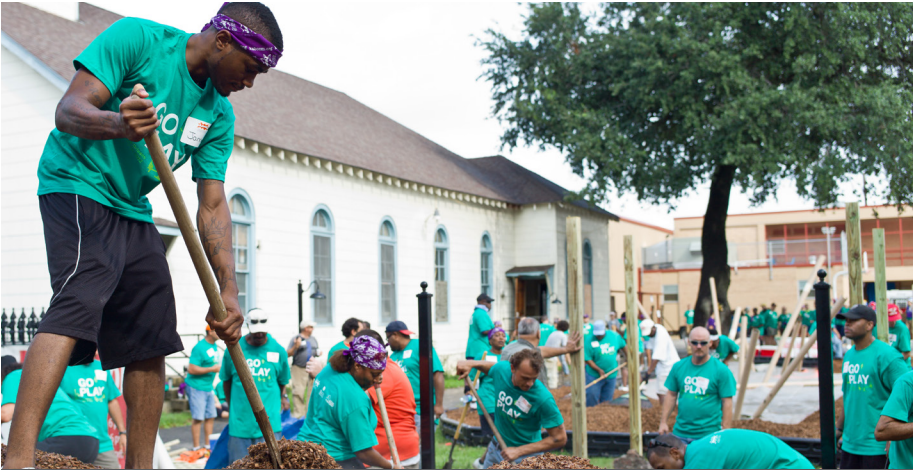
Above: More than a hundred local volunteers helped build the playground sponsored by the CME Group Community Foundation. Below: Children from the neighborhood gather for a ribbon cutting ceremony to celebrate the opening of their new playground.

In 2012, the CME Group Community Foundation partnered with KaBOOM! to build a playground in Central City, New Orleans, for Urban Impact Ministries, an organization dedicated to giving children a safe place to learn, grow, play and thrive. This $93,000 donation completed the CME Group Community Foundation's Hurricane Katrina Relief Effort. Since the disaster struck in 2005, the CME Group Community Foundation and the legacy NYMEX Foundation contributed more than $1 million to help the people of the Gulf Coast rebuild their lives and their communities.