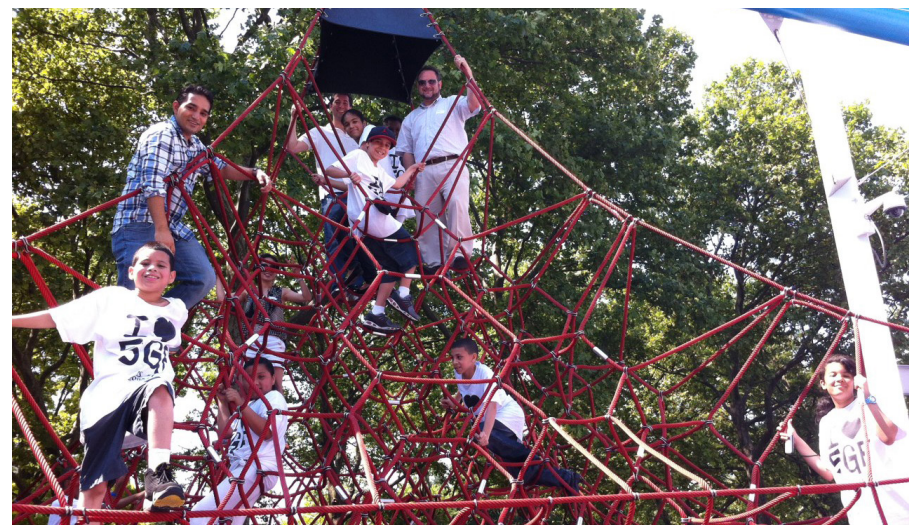
New York employees chaperoned the CME Group-sponsored field trip for graduating fifth graders of PS 277 at the New York Hall of Science.

New York: CME Group was proud to continue its third year of partnership with PS 277 located in the South Bronx. Our New York employees continued to embrace this partnership by sponsoring a teacher appreciation day, sponsoring and chaperoning the annual fifth grade field trip to the New York Hall of Science to celebrate their graduation, and donating much needed printers.