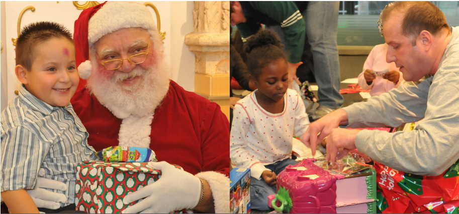
Pre-K and Kindergarten students from Washington Irving Elementary received presents at the annual CME Group Children's Holiday Party.

WORTH OF GIFTS WERE DONATED TO THESE CHILDREN AND FAMILIES