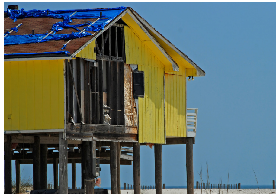
The CME Group Assistance Fund aided several members of the exchange community impacted by Hurricane Sandy, with the repairing and rebuilding of their homes.

CME Group also donated $15,000 to the American Red Cross Disaster Relief Fund to aid those affected by the storm.