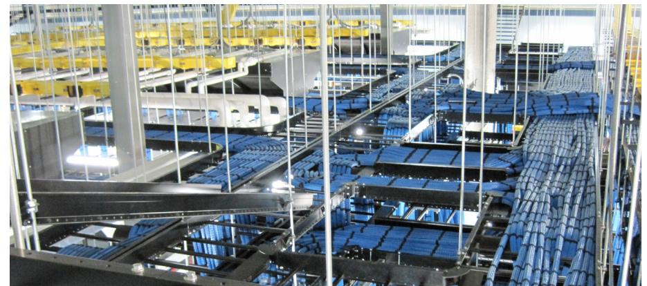
DC3 is the first CME Group data center with its own power substation, allowing power to be distributed at a much higher voltage, with better efficiency, flexibility and environmental sustainability.

DC3 provides critical support to all internal and external business systems — including CME Globex, clearing and regulatory services — by providing continuous power and cooling to these systems. To increase efficiency and environmental sustainability, DC3 is the first CME Group data center that owns and operates its own power substation, allowing power to be distributed at a much higher voltage. DC3 implements evaporative cooling and heat recovery wheels promoting "free cooling." During the winter months, the outside temperature can cool a chilled-water system, allowing the chiller's compressor to be shut down, thus reducing energy consumption more than 35 percent for the year. The completed data center features a 130,000 square foot reflective white roof that dramatically reduces roof surface temperatures and, in turn, lowers cooling costs.