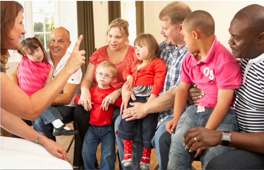
The CBOT Foundation continues to provide a number of non-profit agencies in the Chicagoland area with the funds needed to effect positive change in the lives of those in need.

Its board is composed of volunteer CBOT members who are familiar with the needs of the Chicagoland community. The Foundation supports projects that help to strengthen educational opportunities, promote and protect children and seniors, and support cultural opportunities and animal wildlife. Its focus is on local organizations. However, grants have been awarded to support disaster response and relief as in the case of the September 11, 2001 terrorist attack and Hurricane Katrina. Since 2002, more than 100 organizations have received funding from the CBOT Foundation. In 2012, the CBOT Foundation made grants to 42 organizations totaling $190,500.