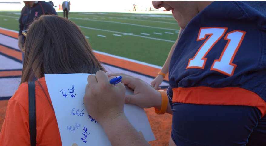
A University of Illinois football player signs his autograph for a child from Carle Hospital.

In July, CME Group held its 3rd Annual Intern Service Day to introduce our student interns to our corporate citizenship programs. More than 30 intern volunteers helped with gardening, cleaning storage units and hosting a bingo event at this shelter for battered women and their families.