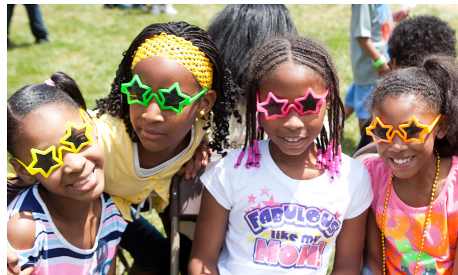
Above: Girls from Washington Irving enjoying their new sunglasses won at the Annual Community Picnic. Below: CME Group Amicus volunteers prepared decorations and meals to throw a Thanksgiving party for the families at the Salvation Army Emergency Lodge.